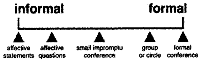
Continuum of Restorative Practices